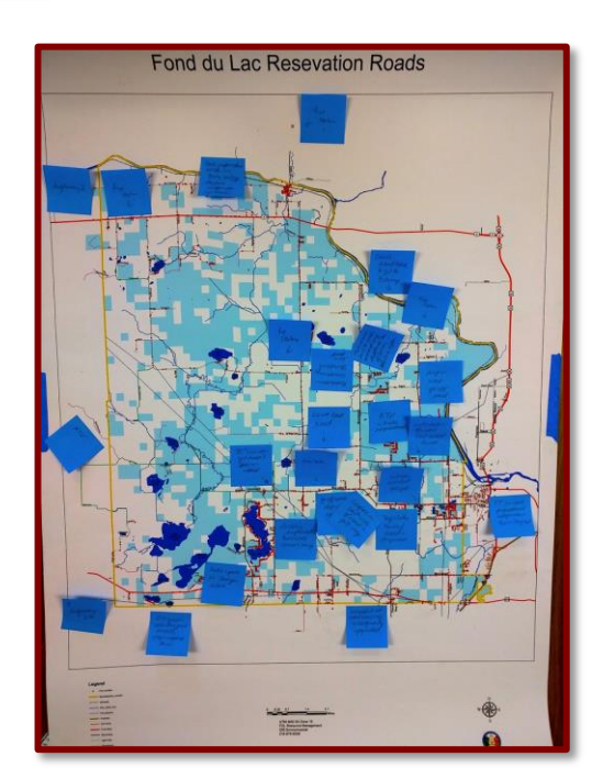
Mark-up from focus group with expert drivers, showing multiple pedestrian safety issues