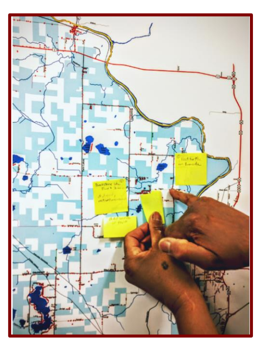
Resident using map to point out areas of concern, including 3 pedestrian safety issues