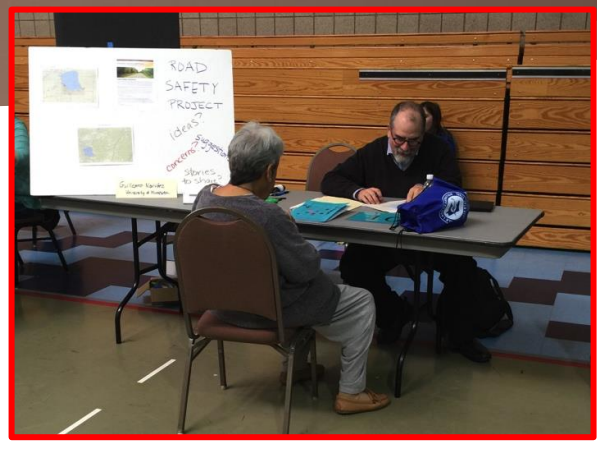
Gathering community input at health fairs with Mille Lacs Band, October 2015 (above) and Red Lake Nation, July 2015 (below)