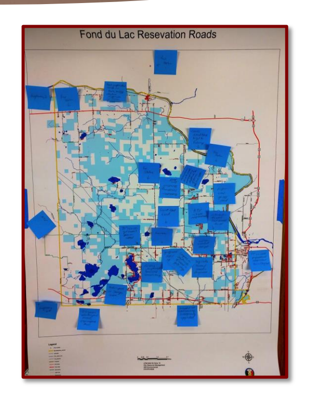
Mark-up from focus group with expert drivers, showing multiple pedestrian safety issues